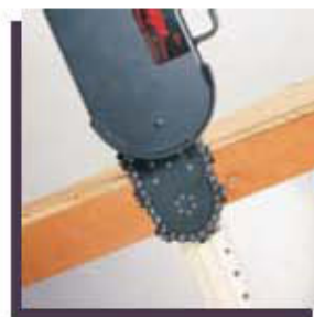
Fig. 2 - 90° Angle