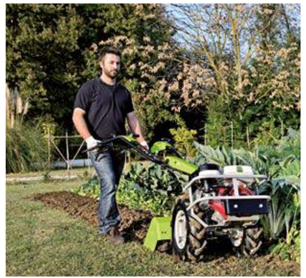
WE-G108 GX 270 Honda